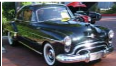
So Cal Pick