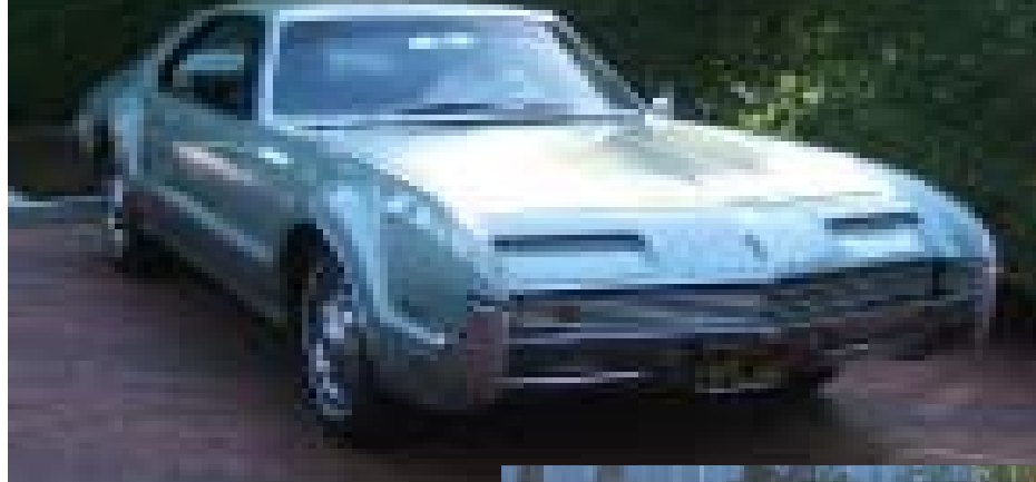
Best of Show